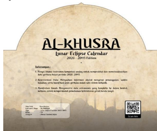
Figur 3. Rear Cover

In addition to the information window, this front cover features a Central Indicator Line and a classic astronomy-themed visual design that helps users accurately align the disk position.