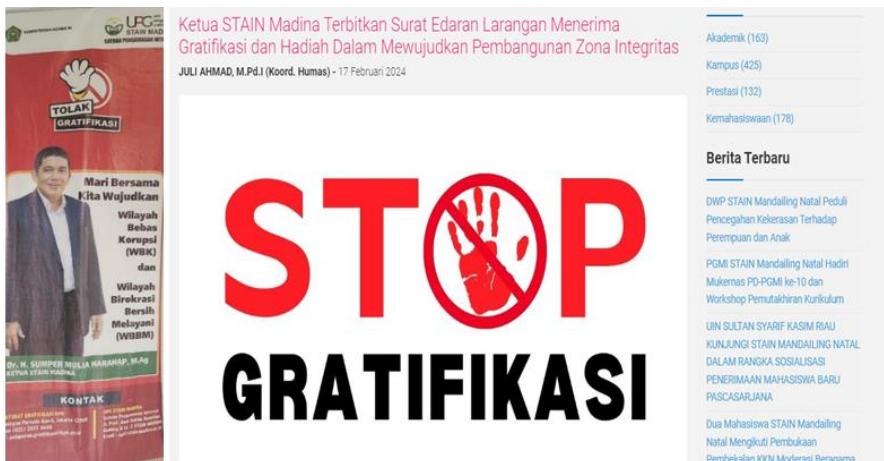
Figure 1. Example of Anti-Gratification Reinforcement at STAIN Mandailing Natal

The anti-gratification campaign and training for academic staff and students are crucial for fostering an anti-gratification culture within PTKIN (State Islamic Religious Universities). This is similar to what has been implemented in every PTKIN that has collaborated with the Corruption Eradication Commission (KPK). A strong and transparent monitoring system is also necessary to identify and address gratification. Internal oversight in PTKIN needs to be strengthened, and reporting gratification should be made easier and safer for whistleblowers. The use of the corruption prevention module and the ACCH channel from the KPK is also very important for information on combating corruption. 65